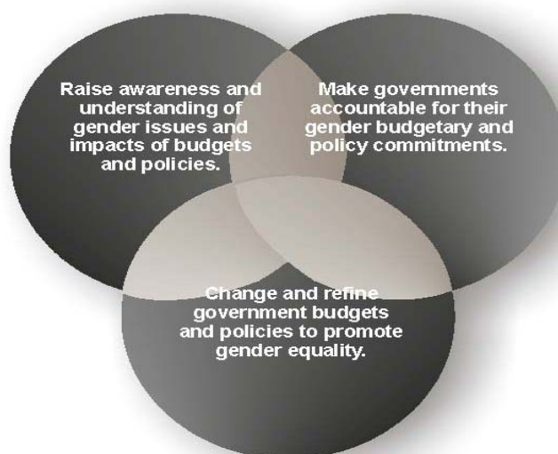
Figure 2: Goals of Gender Responsive Budgeting

Gender Responsive Budgeting aims at mainstreaming gender into public finance. GRB does not mean separate women's budgets, but that general budgets include a GE perspective. This means that not households are the target of public finances, rather the differential needs and interests of women and men are used as basis of revenue-raising and public spending. Importantly, GRB acknowledges the relevance of unpaid work, especially care work that usually is disregarded in national accounting systems and the GDP.